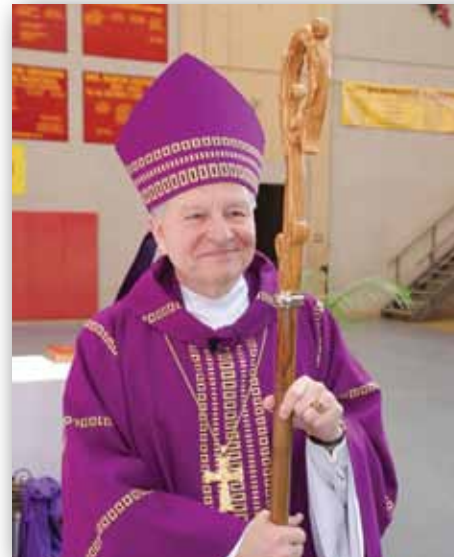
Archbishop Gregory Aymond, of New Orleans